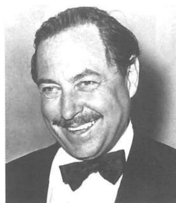
Tennessee Williams 1911 – 1983