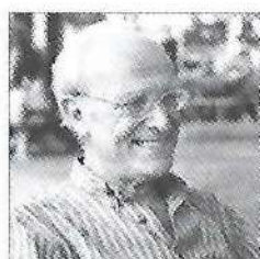
Production Support / Prompter: Eric Collino

One of the most valuable and appreciated jobs in our production: Being there when needed - in many roles and in many ways.