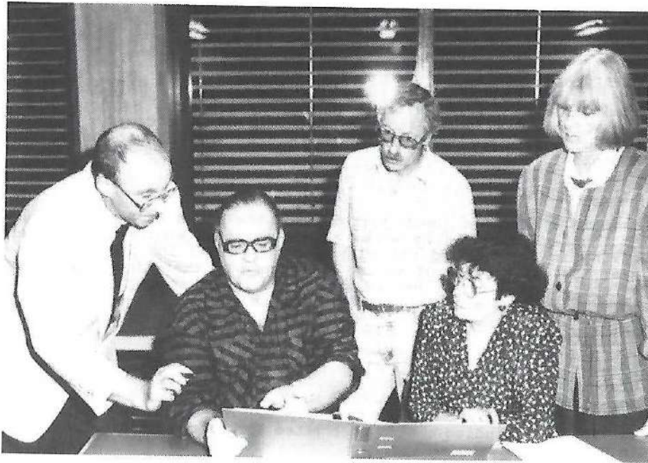
The production team confers with the director.