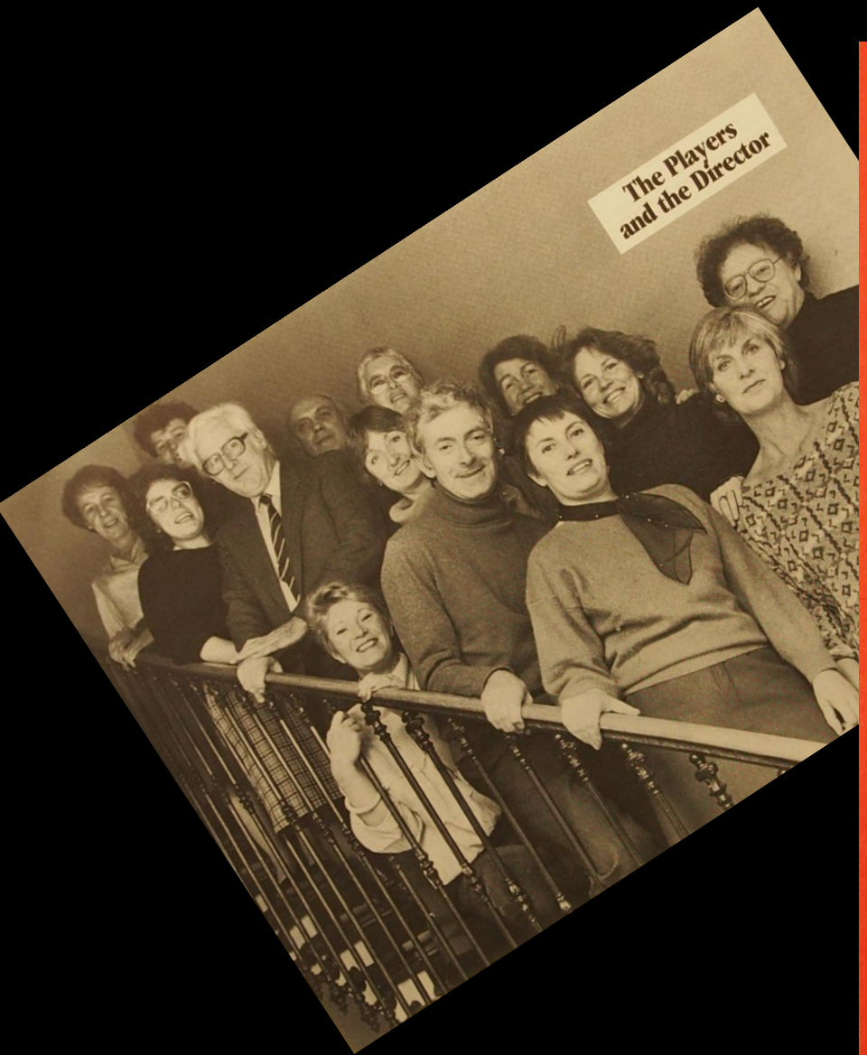
The Players and the Director

The Semi-Circle presents Terence Rattigan's