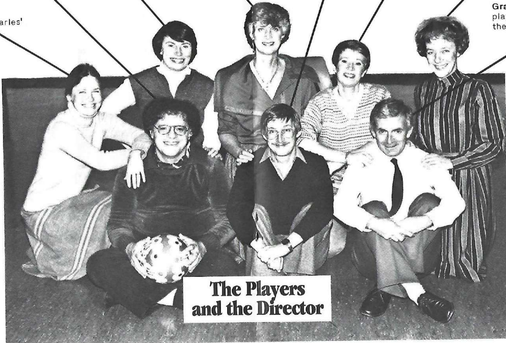
The Players and the Director